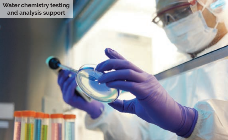
Water chemistry testing and analysis support