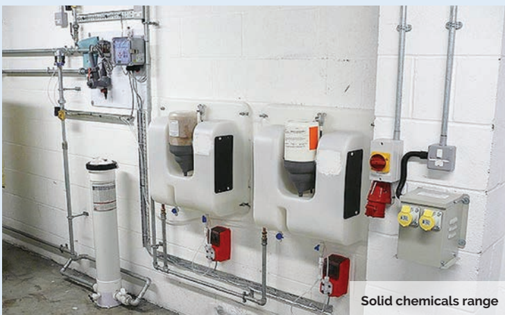
Solid chemicals range