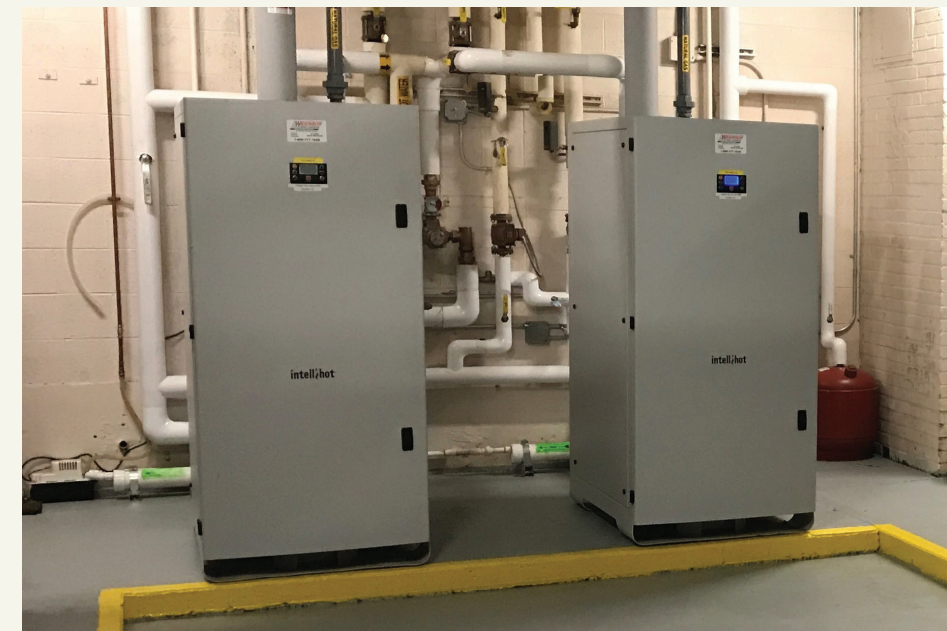
Below: Two Intellihot IQ 1001's