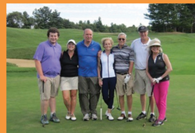
Friends of Fragile Footprints

suffering, optimizing function, and providing opportunities for personal and spiritual growth."