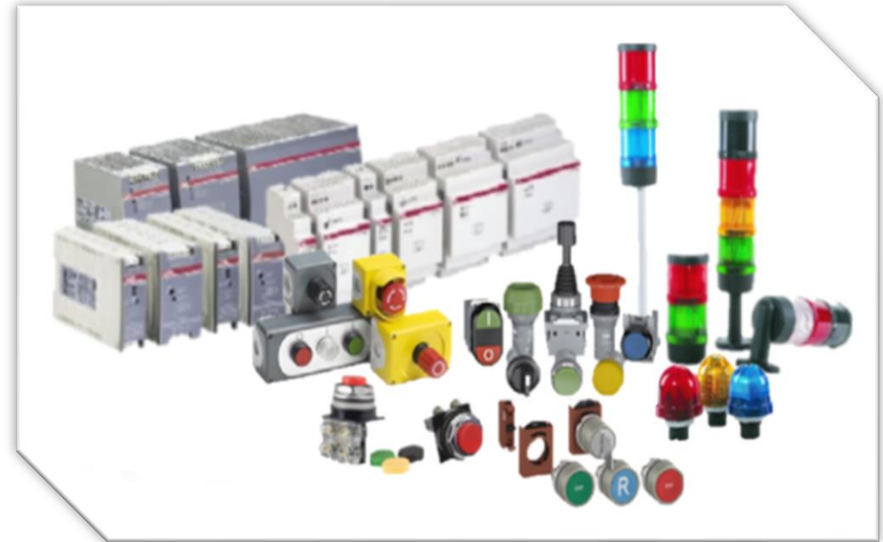
Complete ABB safety offering