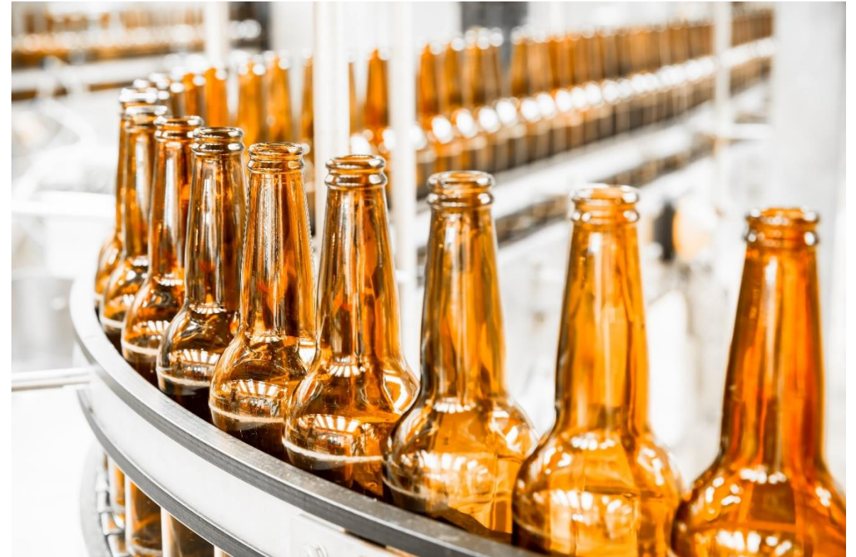
ABB Low Voltage Products