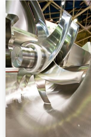
Machine Safety Services

Important: The Jokab Safety 1-888-282-2123 technical support number is no longer available, please use 1-888-385-1221 Option 1 or email: EPPC.Support@us.abb.com