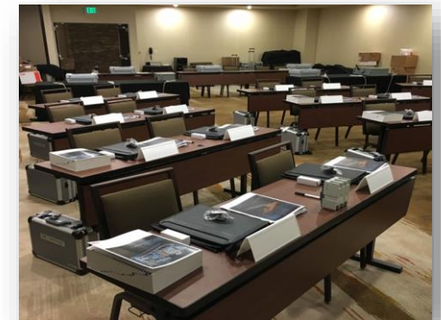
Machine Safety Training