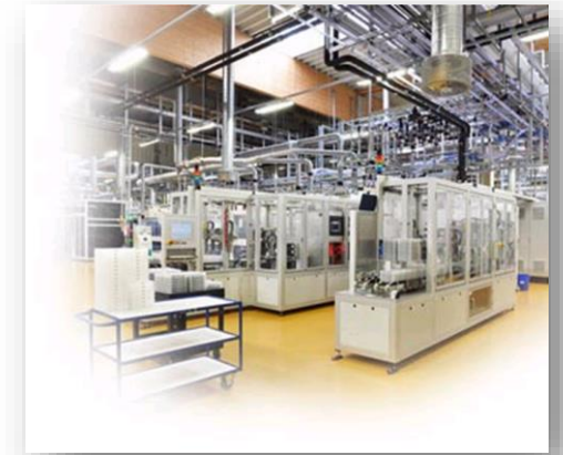
Quick Guard aluminum fencing system