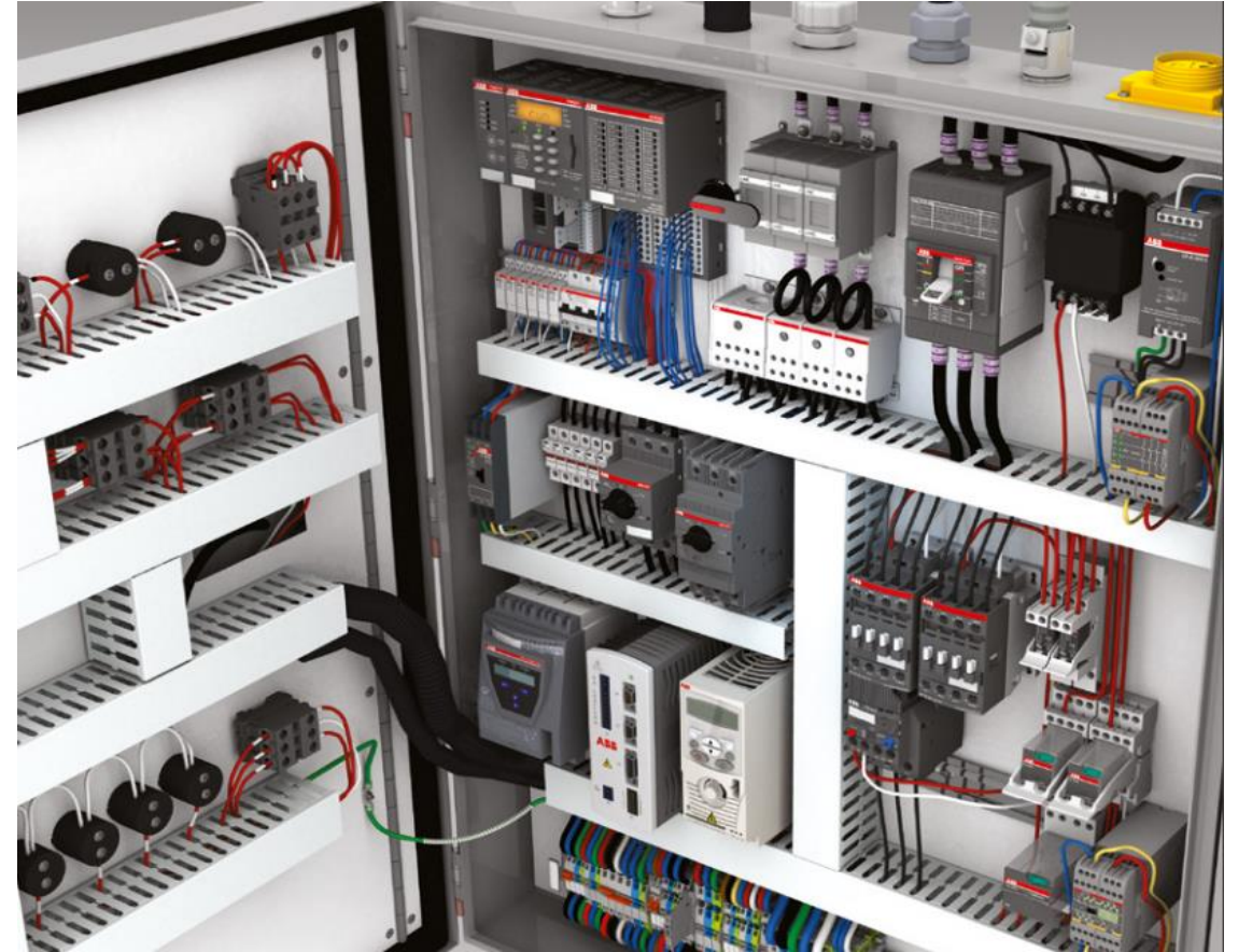
ABB Low Voltage Products