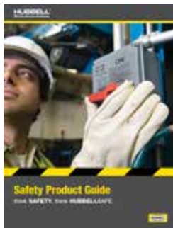
Safety Product Guide