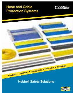
Hose and Cable Protection Systems