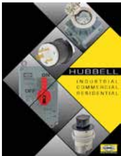
Hubbell Wiring Device-Kellems Full Line Catalog

Hubbell offers an extensive literature library for product support. Downloadable PDFs are available online.