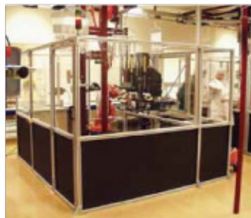
Quick-Guard Standard with black and transparent Polycarbonate in-fill panels as used for medical applications.