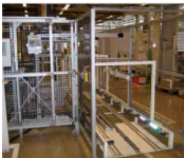
Quick-Guard Standard assembled with mesh.