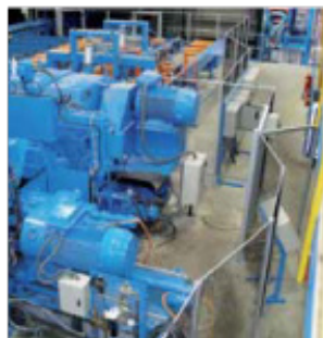
Quick-Guard E with few components and easy to angle at up to 45°.