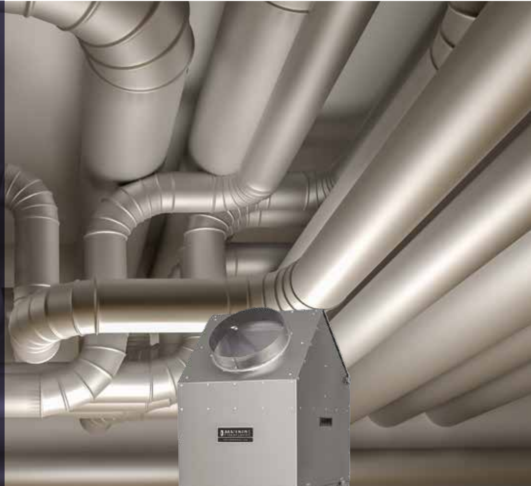
HEPA-AIRE® H2500C PORTABLE POWER VACUUM PART NO: H2500C

Most of the Abatement Technologies electric-powered products in this brochure are available in 230 volt/50 Hertz and 230 volt/60 Hertz models for overseas customers. Contact our Duct Cleaning Export Sales Department for more information.