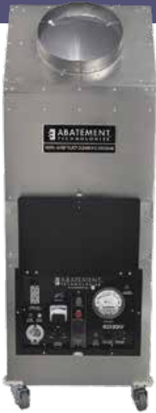
PART NO: H2500IV