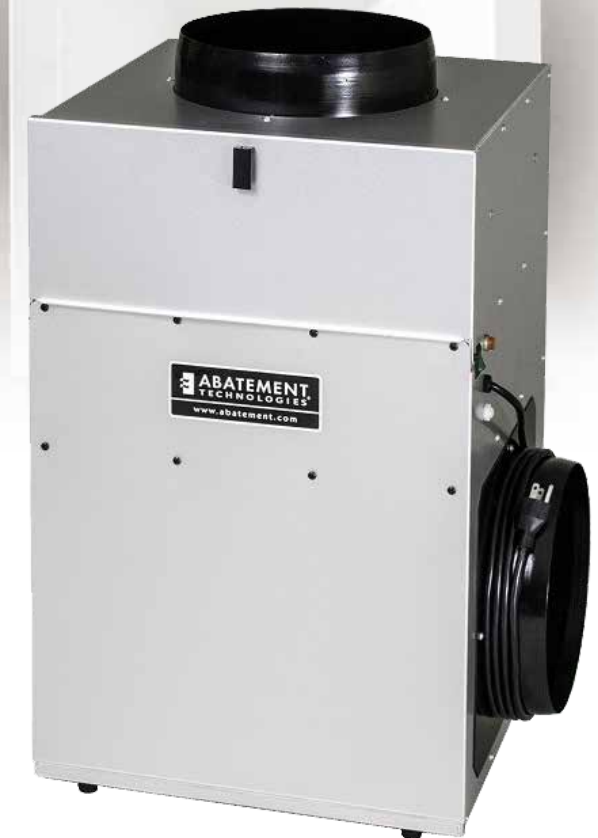
CAP ® 600-UV AND CAP ® 600-UVP PURIFIERS PART NO: 600-UV & 600-UVP

CAP ® 600 and 1200 series systems are designed for professional installation into the HVAC air return duct near the air handler, in an out of the way location such as a basement, crawl space or attic. A 'partial bypass' installation configuration enables the device to purify about 50% of the return-air during each pass through the HVAC system. Typically, the entire air volume within the living space of a home can be HEPA filtered 50 to 75 times per day.