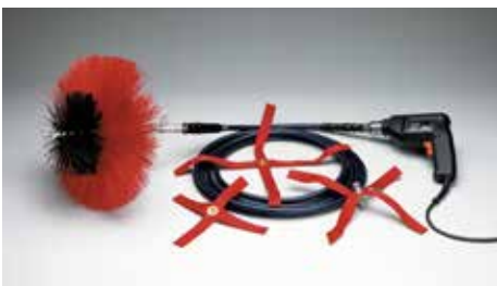
PART NO: K3-1020

The Abatement DUCT-PRO® Power Whip is a 20 foot long, bidirectional drive cable powered by a standard 3/8" or 1/2" electric drill (not included). Whip straps attached to the end of the Power Whip provides aggressive agitation inside the duct system. Special duct brushes can be substituted for the whip straps to provide additional agitation options.