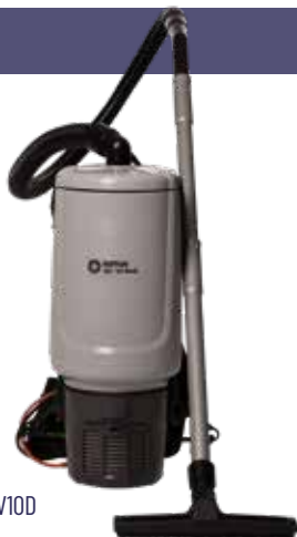
PART NO: V10D