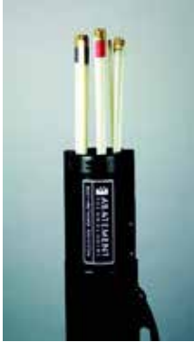
PART NO: C5000

The unique DUCT-PRO® Power Rod System from Abatement Technologies is a versatile agitation device and compressed air tool used to remove caked-on dirt and debris from air duct systems. The Power Rod System blasts compressed air through flexible rods to scrub every square inch of the ductwork in a variety of duct types and configurations.