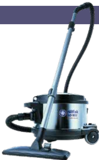
PART NO: V930D