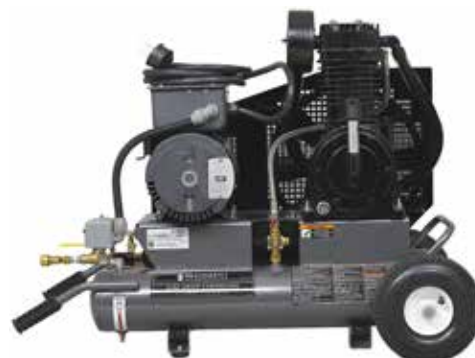
C17-E AIR COMPRESSOR PART NO: C17-185-E