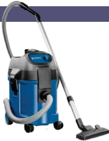
PART NO: V8000WD