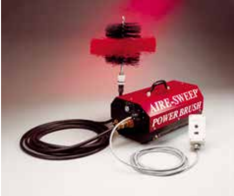
PART NO: K3-2000

Abatement Technologies AIRE-SWEEP® Power Brush System provides superior duct cleaning performance using specially designed rotary brushes and compressed air to safely remove caked-on dirt and debris from all types of ductwork surfaces. The lightweight, compact electric power unit drives the 25' cable to turn the color-coded cleaning brushes. A remote device gives the operator total control at the point of brush operation.