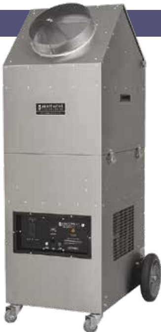
PART NO: H2500C