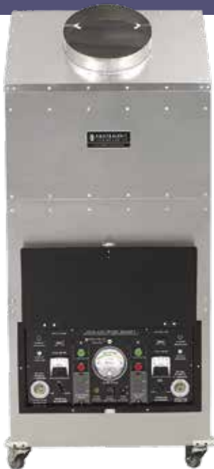
PART NO: H4500IV