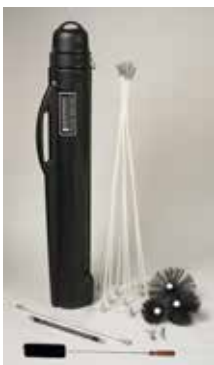
PART NO: K3-4000

The Abatement Technologies Dryer Vent Cleaning System is designed to increase revenue by adding dryer vent cleaning services for professional duct cleaners. Using a standard power drill (not included), this specially-designed tool loosens debris from dryer vents, prior to removal, using compressed air.