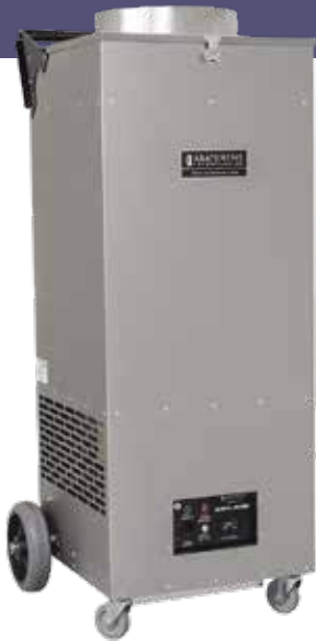
PART NO: H2200