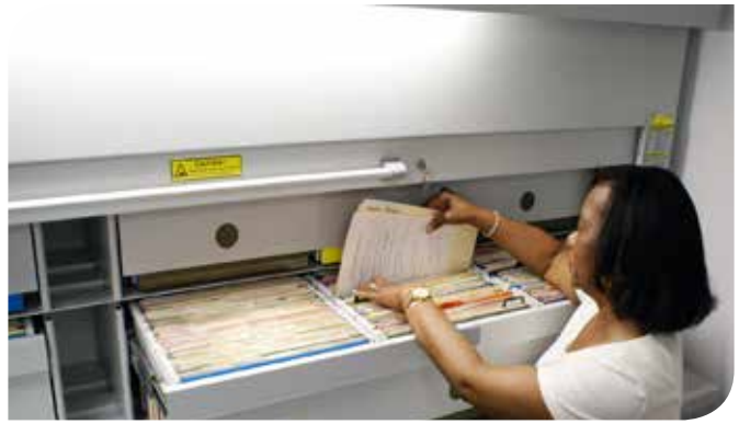
Rollout Drawers with Hanging Lateral files