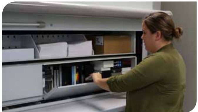
Secure Media Storage

Kardex Remstar, LLC 41 Eisenhower Drive, Westbrook, ME 04092 800-639-5805 www.KardexRemstar.com info@kardexremstar.com