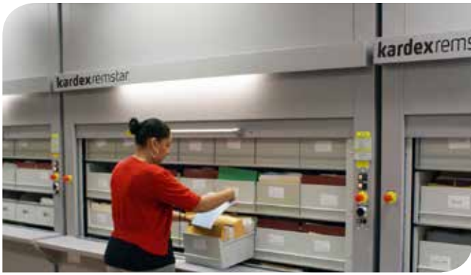
Removable Top Top Letter Files