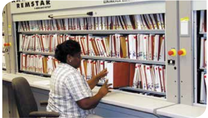
Side Tab Files Seated Position