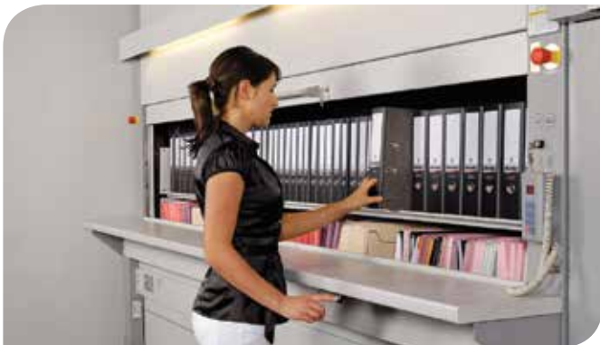
Book & Binders