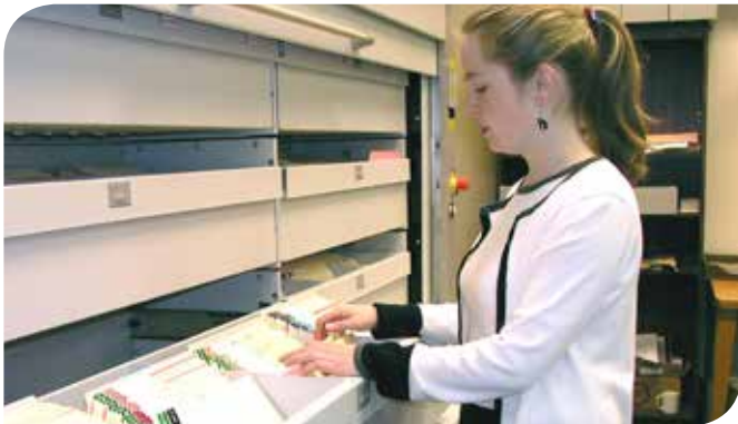
Rollout Drawers with Top Tab Files