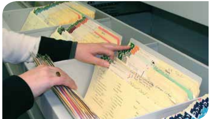
Rollout Drawers with Top Tab Files