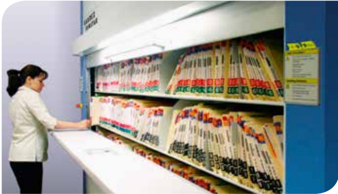
Side Tab Files Standing Position