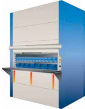
Adjustable Work Counter