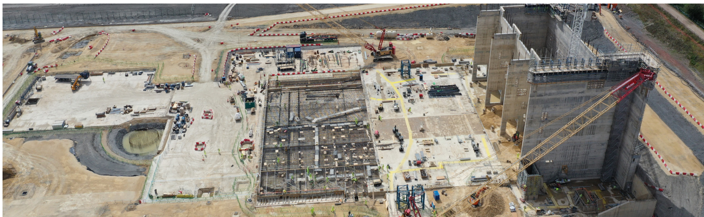
An aerial view of the construction site (September 2019)

Construction is well underway on the Rookery South Energy Recovery Facility. This important infrastructure project will divert non-recyclable waste that, at present, is sent to landfill sites or exported for treatment at European energy-from-waste plants.