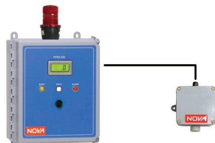
580DR1 - Alarm Unit and Single Diffusion-Style Sensor in Separate Enclosures