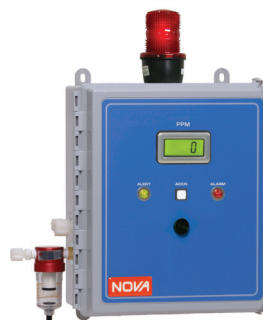
591P - Pump Style in NEMA 12 Enclosure (models shown with optional strobe light)