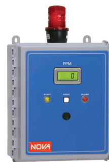
596D - Diffusion Style in NEMA 12 Enclosure