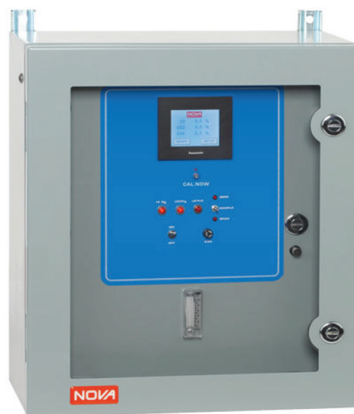
923C ( O_2 , CH_4 , & CO_2 analysis with Full Autocalibration)