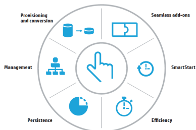
Figure 3. 3PAR Software Suites enhance the agility and efficiency of your infrastructure.

Building on HP 3PAR Operating System software, HP offers a range of standalone software products and bundled software suites to enhance the agility and efficiency of your infrastructure and enable you to eliminate compromise.