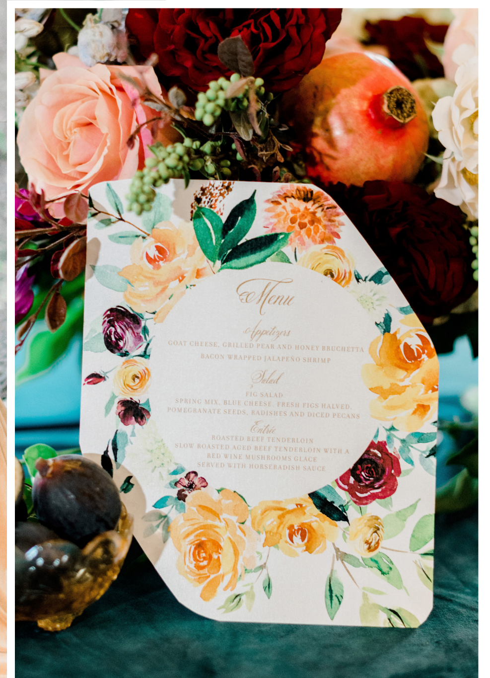
Rachel Elaine Photography | Vella Nest Floral | Gold Dust Vintage