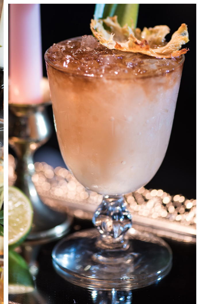
Powers Photography Studio | Bridal Bliss | Rusted Vase Co