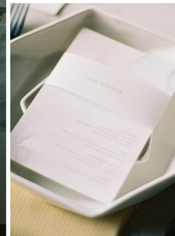
Simply by Tamara Nicole | Gather Design Company | Canvas Event Space