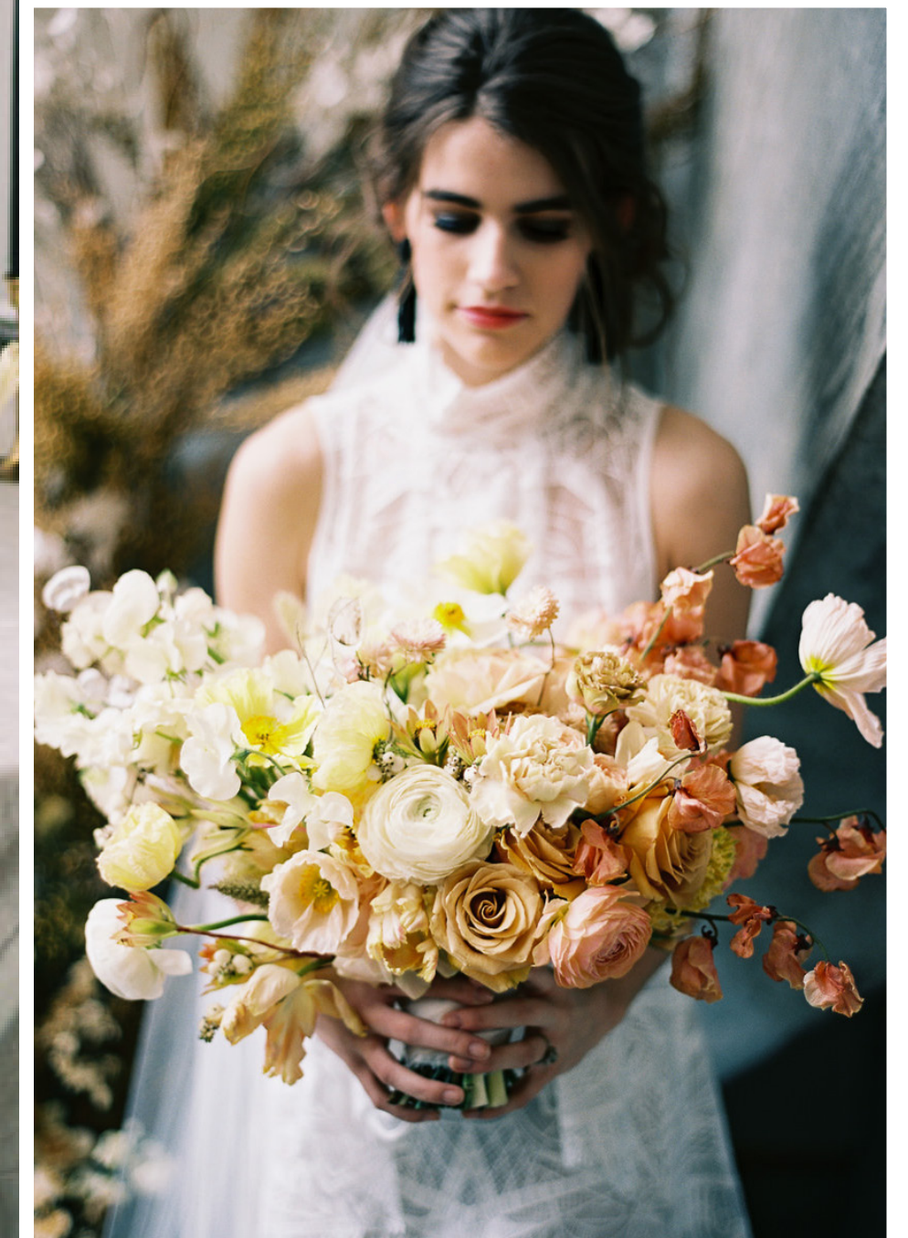
Simply by Tamara Nicole | Gather Design Company | Canvas Event Space