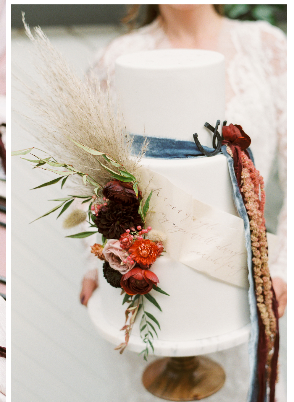
Shi Shi Events | | Baker Creek Farm | Molly Taylor and Co.