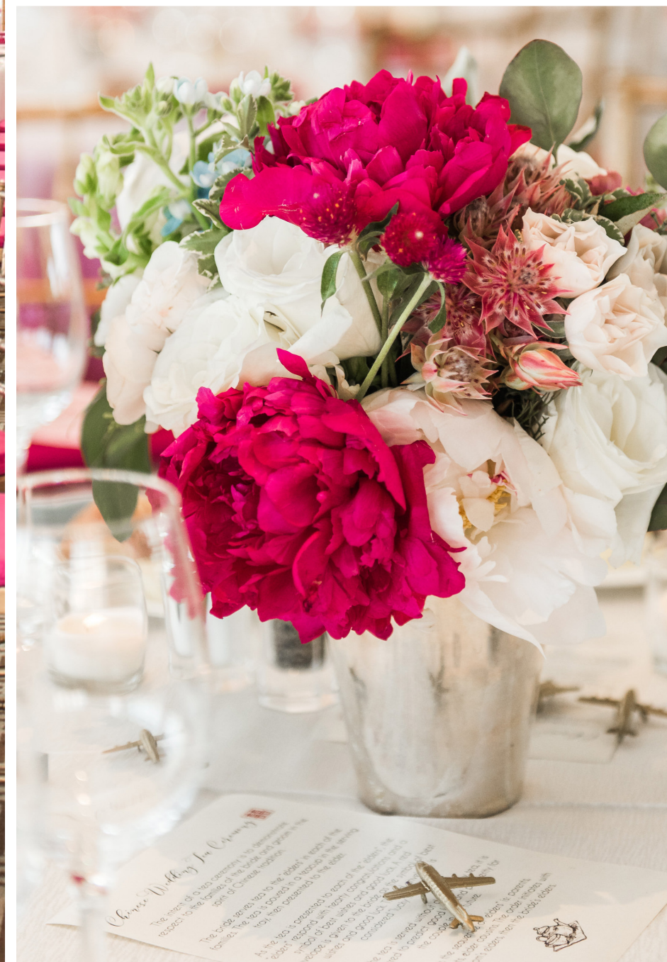
Cheers Darling Events | Sidra Forman