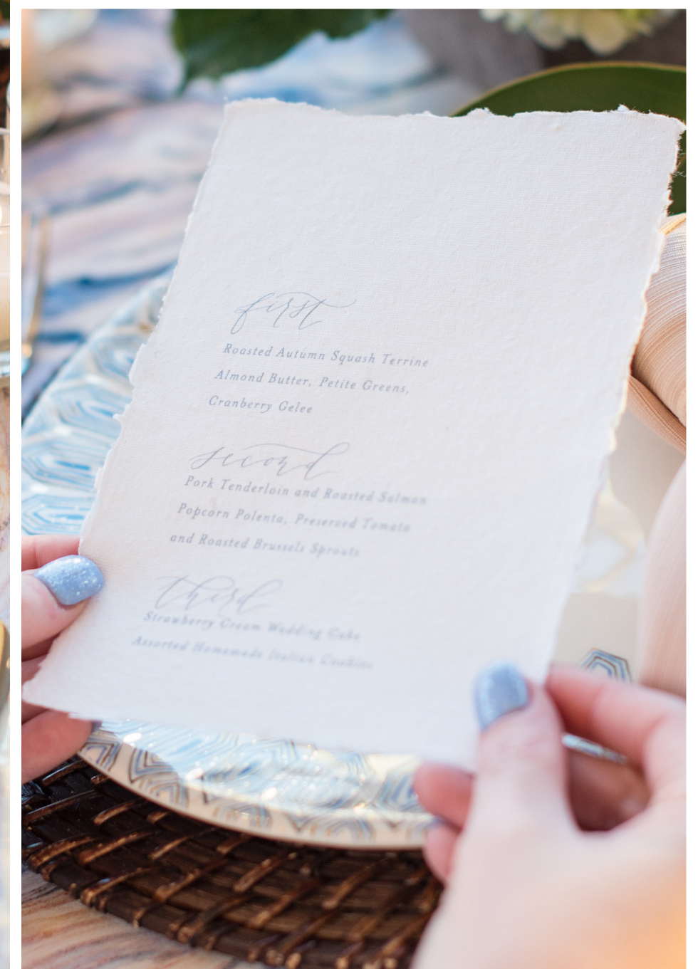
Hilton St. Louis At The Ballpark