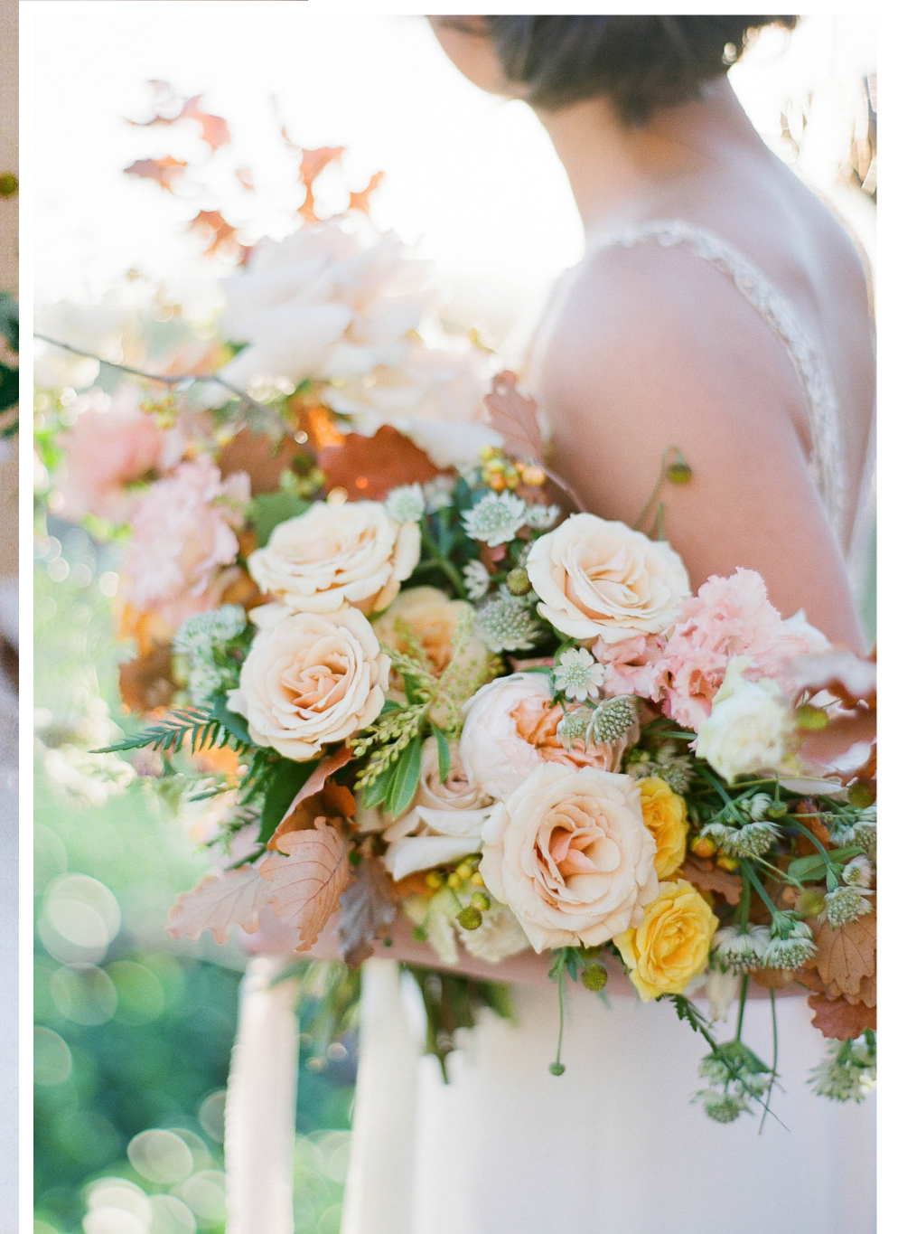
The Wildflower AZ | Blackstone Country Club