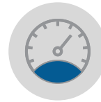
Weights and Measures