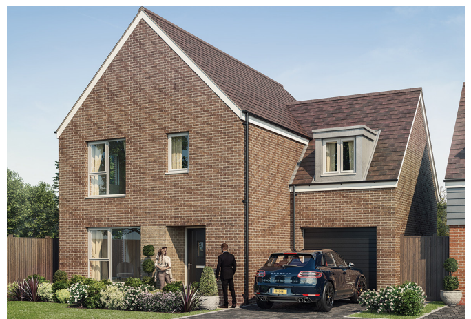
112 homes built by Hill Residential Ltd in conjunction with Homes England set around a cricket green with a newly built pavilion.

set around a cricket green, which we are selling on behalf of Hill Residential.