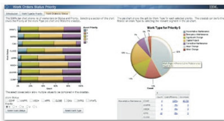
Active report analysis

By using these powerful and complementary IBM software suites, we can provide a consistent and comprehensive approach to managing all asset types. This allows organisations to maintain proactive day-to-day maintenance, but more importantly, use operational data to better predict future events, undertake 'what if' scenario analysis and act upon that insight to drive better business outcomes.