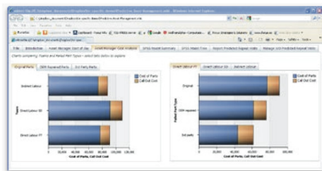
Insight into cost elements

“We have known that reactive maintenance can cost five times the equivalent planned activity. Now analytics can help us to power processes that do something about it.”