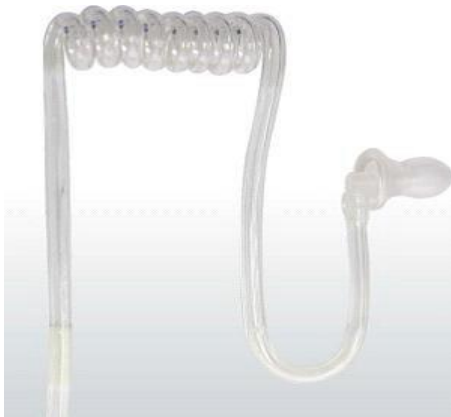
QD Acoustic Tube