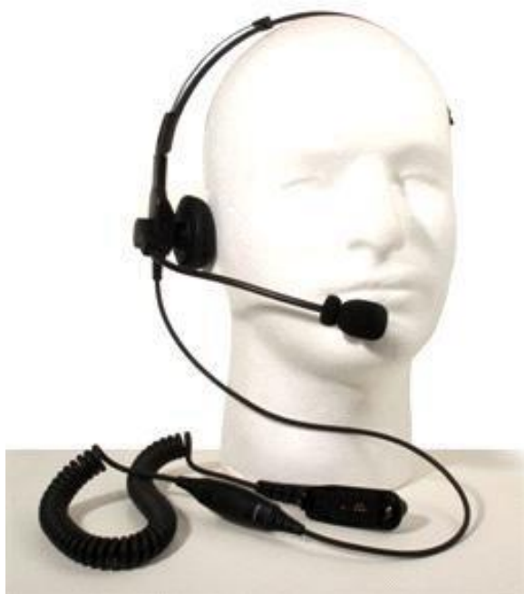
WV-POH1-M11-Mono Single Muff Headset