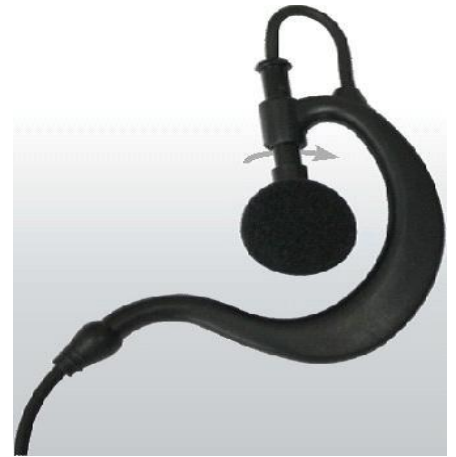
W-Scorpion Ear Piece