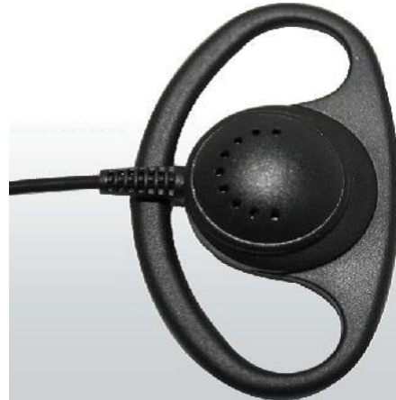
D-Shaper Ear Hanger