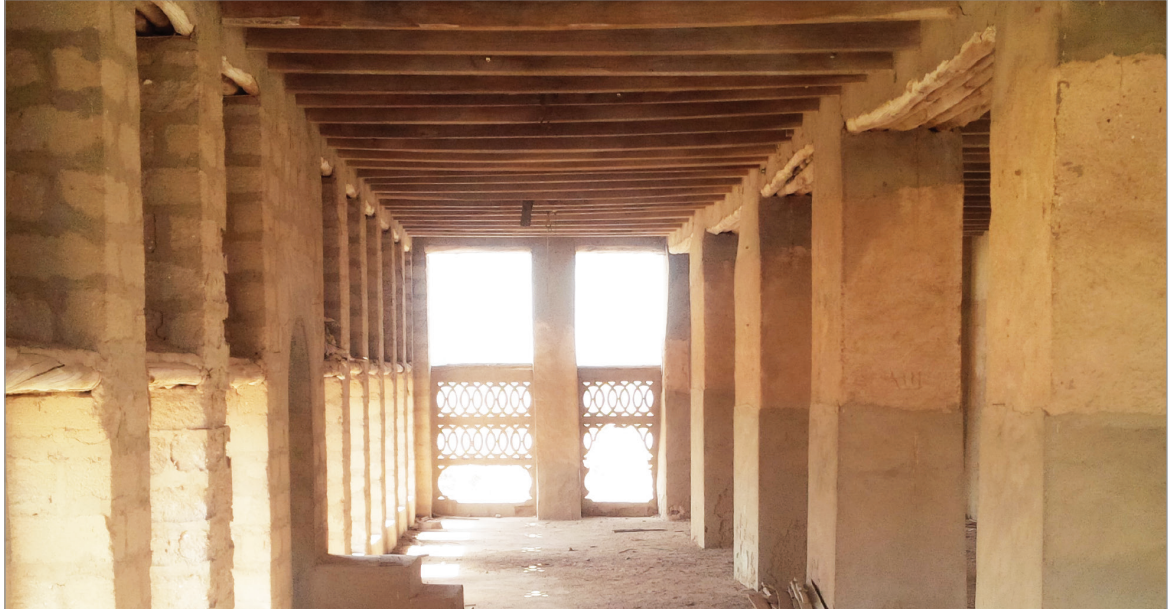
Figure 9. Al-Ghubb Mosque

earlier in this paper, Ras Al Khaimah's cultural heritage can be both preserved for future generations and promoted as a viable source of income in the present.