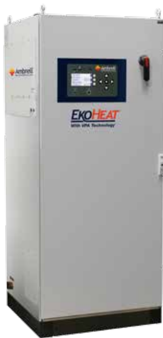
65 to 250 kW with models covering the four frequency bands 50 to 150 kHz 15 to 40 kHz 5 to 15 kHz 2 to 6 kHz