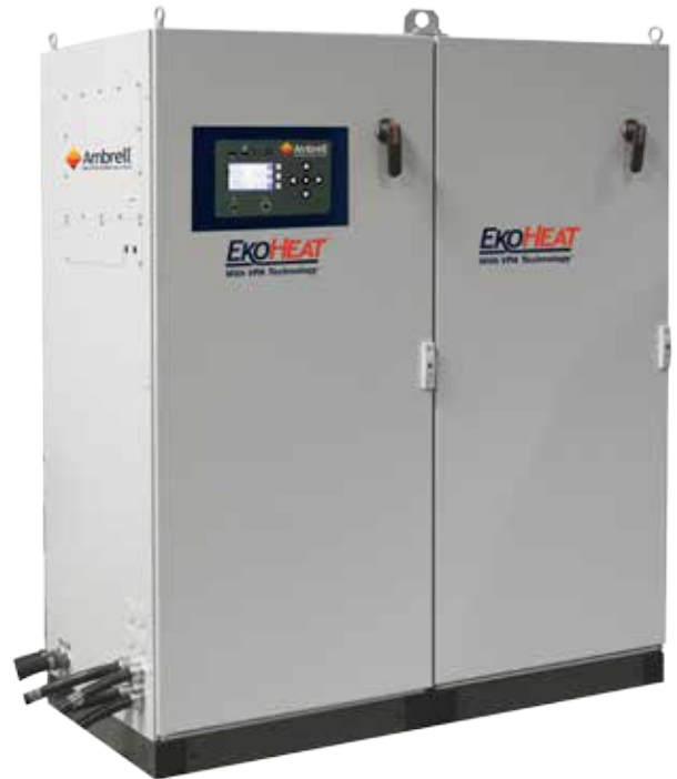
180 to 500 kW with models covering the four frequency bands 50 to 150 kHz 15 to 40 kHz 5 to 15 kHz 2 to 6 kHz