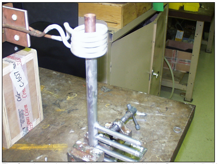
The Cu tube to aluminum joint assembly inside the five-turn helical induction heating coil