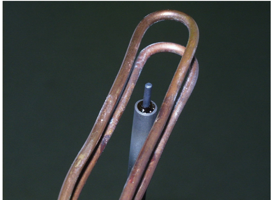
Glass preform melting as temperature is reached