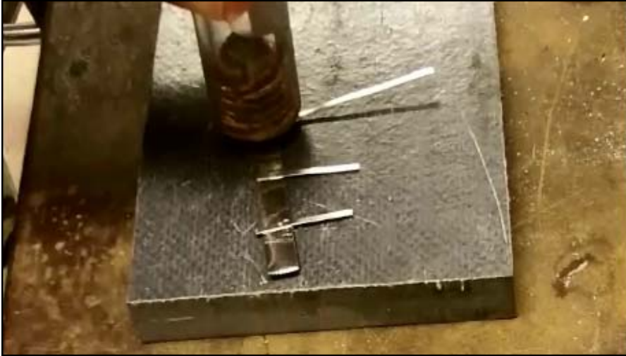
The assembly during heating.