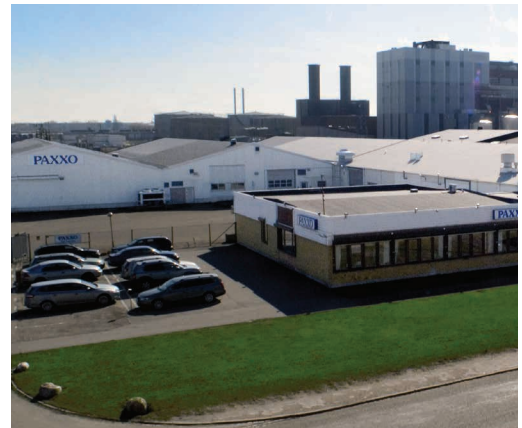
Paxxo was founded in 1980 based on making continuous liners.

We offer the Longopac for Dust in several different strengths and three different formats: Maxi, Midi and Mini. We also offer with guaranteed levels of anti-stat for ATEX environments.