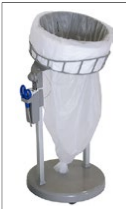
Item no. 31400