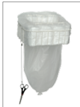
Item no. 34310

Longopac Wall Solutions are loaded with the Longopac cassette, Maxi or Mini. Available in 6 colors and 2 strengths.