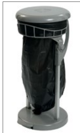
Item no. 31600

Longopac Stand Mini is loaded with the Longopac Mini cassette that is up to 60 meters long. Available in 6 colors and 2 strengths.