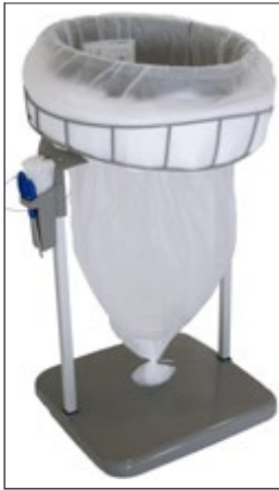
Item no. 30070