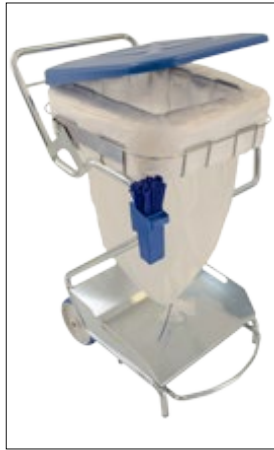
Inox Item no. 30120 FZB Item no. 30150

Longopac Stand Maxi is loaded with the Longopac Maxi cassette that is up to 110 meters long. Available in 6 colors and 2 strengths.