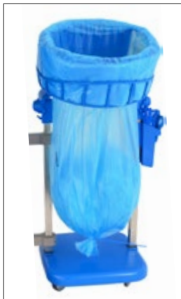
Item no. 31436