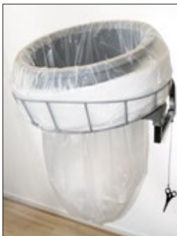
Item no. 30080