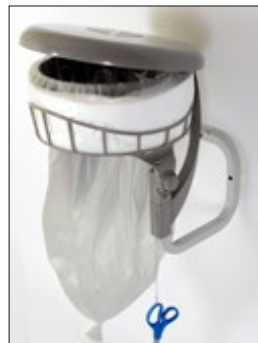
Item no. 31420