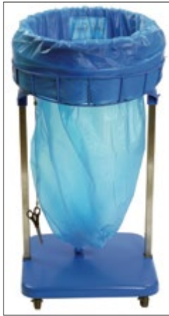
Item no. 30116