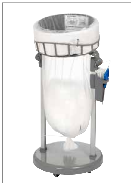
Stand Classic Mini/Mini Food