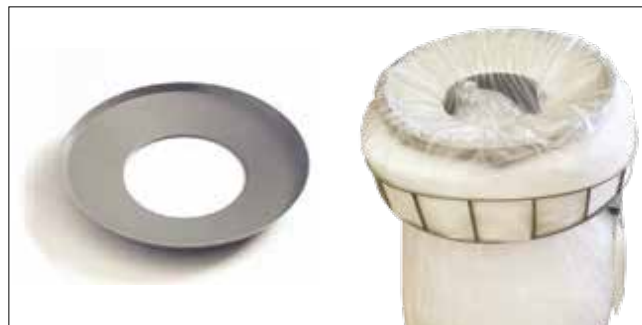
Adapter disc for Longopac Stand Classic Maxi Item no. 30170 Reduces the aperture for easier compression of e.g. recycled plastic. Only available for Maxi.