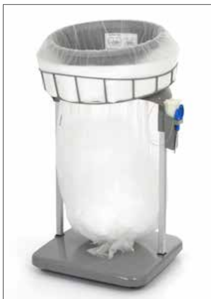
Stand Classic Maxi/Maxi Food