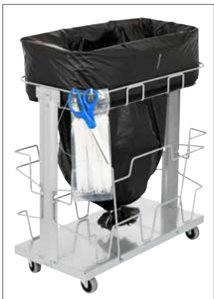
Stand Dynamic UBS