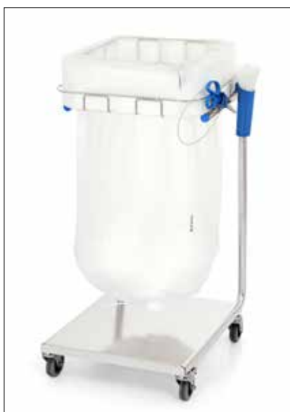
Stand Dynamic Midi/Midi Pedal