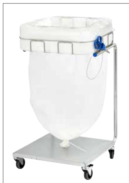
Stand Dynamic Maxi/Maxi Pedal