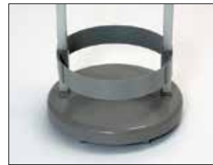
Frame for Longopac Stand Classic Mini Item no. 33890 The frame holds the bag in place.