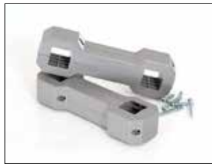
Connector for Longopac Stand Classic Item no. 33750 Connects two or more Longopac Stand products simply and securely. It is also possible to connect Maxi to Mini.