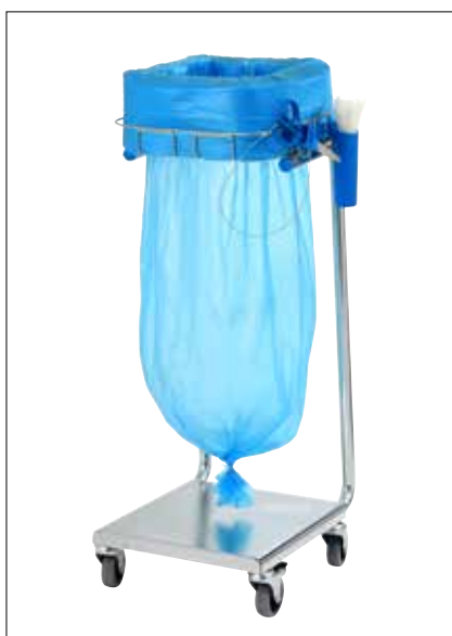
Stand Dynamic Mini/Mini Pedal