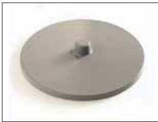
Lid for Longopac Stand Classic Maxi and Mini Mini Item no. 31140 Maxi. Item no. 30140