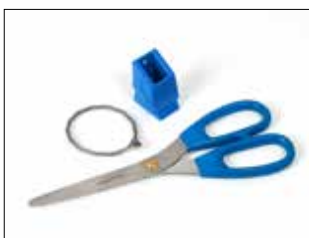
Scissors kit for Longopac Stand Dynamic, metal-detectable Item no. 34609 Kit containing metal-detectable scissors, scissors holder, stainless steel wire.