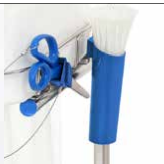
Cable-tie holder for Longopac Stand Dynamic Item no. 30410 (only holder) The cable-tie holder for the Dynamic range is suitable for Mini, Midi and Maxi Dynamic.

Metal-detectable, blue. Product no. 30416 The cable-tie holder speeds up bag changes even more and holds the cable ties in place. Suitable for both Maxi and Mini, and available in two versions.