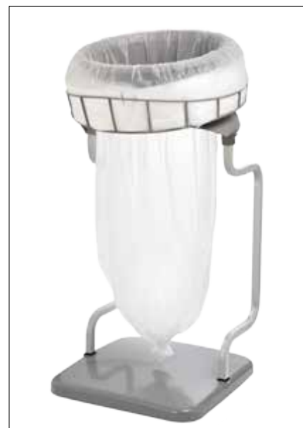
Stand Classic Recycling