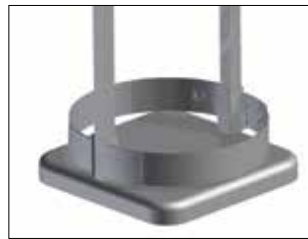
Frame for Longopac Stand Classic Maxi Item no. 33900 The frame holds the bag in place.