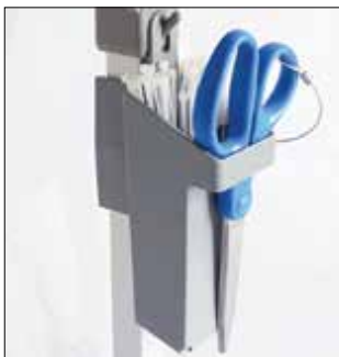
Cable-tie holder for Longopac Stand Classic Standard, grey. Item no. 30410

Metal-detectable, blue. Product no. 30416 The cable-tie holder speeds up bag changes even more and holds the cable ties in place. Suitable for both Maxi and Mini, and available in two versions.