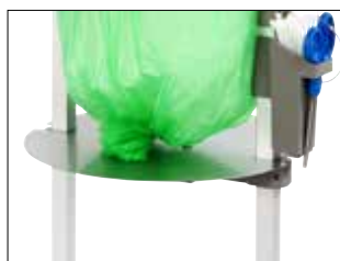
Adjustable plate for Stand Classic Mini Item no. 31480 Reduces the consumption of bag material and reduces the size of the bag. Primarily intended for use with sticky, heavy waste. Can be used for Bio bag cassettes.