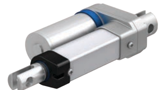
SKF Linear Actuator