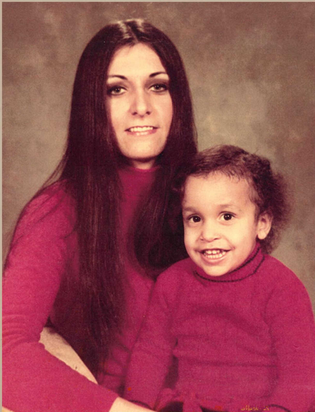
ME & MOM AGE 4