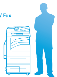
WorkCentre 5335 with High-Capacity Tandem Tray