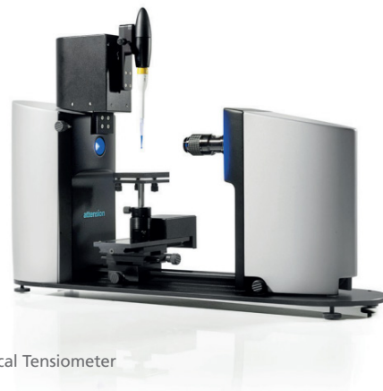
Theta Optical Tensiometer

Only if the contact angle hysteresis is negligible, the wetting properties of a surface can be characterized by a static contact angle, which is measured by placing a droplet to the surface and optically determining the contact angle. Generally for rough surfaces, dynamic, i.e., advancing and receding contact angles need to be measured, since a static contact angle can take any value between the advancing and receding ones. In principle, the dynamic contact angles can be defined either by changing the droplet volume or by tilting the droplet or by using a Wilhelmy plate method with the force tensiometry. This application note describes the dynamic contact angle measurement by changing the droplet volume on superhydrophobic surfaces, as illustrated in Figure 1.