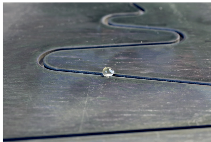
[Figure 2]: A Water droplet in a superhydrophobic track.

The superhydrophobic tracks were prepared in metal plates by milling or laser cutting and in silicon by ion etching. The metal surfaces were coated using a combination of silver microstructure and a fluorinated thiol surfactant, and the silicon wafers were coated with a fluoropolymer in CF3 plasma. Figure 2 shows a water droplet in a superhydrophobic track.