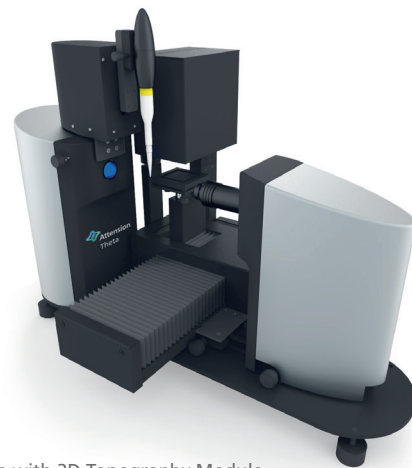
Attension Theta with 3D Topography Module

On a real surface the actual contact angle is the angle between the tangent to the liquid-vapor interface and the actual, local surface of the solid (Figure 1(b)). However, the measured (apparent) contact angle is the angle between the tangent to the liquid-vapor interface and the line that represents the apparent solid surface, as seen macroscopically. Actual and apparent contact angle values can deviate substantially from each other. To calculate real surface free energies of the solid the actual contact angles should be used.