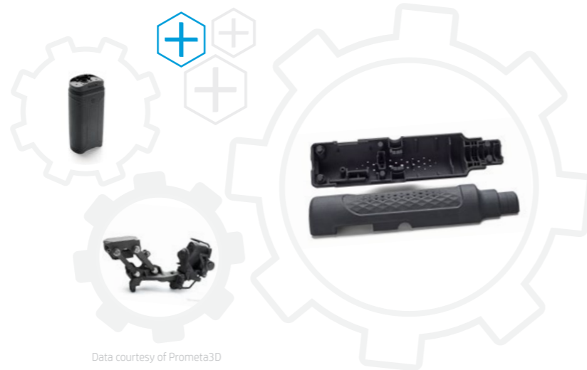
Data courtesy of Prometa3D

Certifications: Biocompatibility, 8 REACH, RoHS (for EU, Bosnia-Herzegovina, China, India, Japan, Jordan, Korea, Serbia, Singapore, Turkey, Ukraine, Vietnam), PAHs, Statement of Composition for Toy Applications, UL 94 and UL 746A Certification