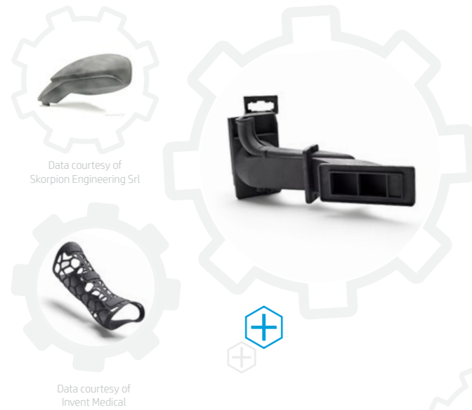
Data courtesy of Skorpion Engineering Srl