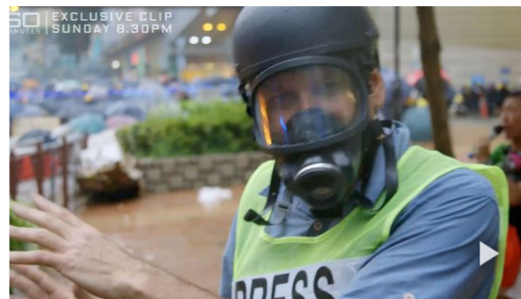
Sneak peek: Hong Kong | Sunday on 60 Minutes

These slides are not to be used for external purposes, without the permission of The Banyans Health and Wellness. Copyright The Hong Kong 2019.