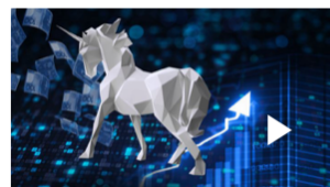
Rise of the Unicorns