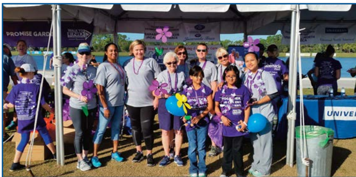
Jacaranda Trace staff, residents, and families at the Alzheimer's Walk