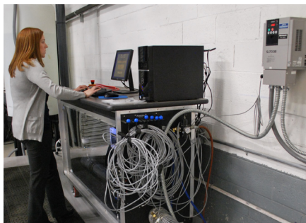
PREPARE WRITTEN DOCUMENTATION OF RESULTS