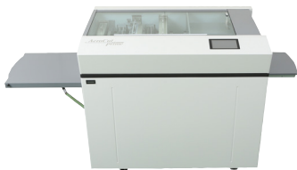
UCHIDA AEROCUT PRIME CUTTER & CREASER