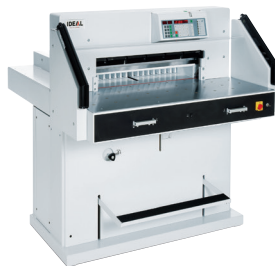
IDEAL 7260LT GUILLOTINE ELECTRIC