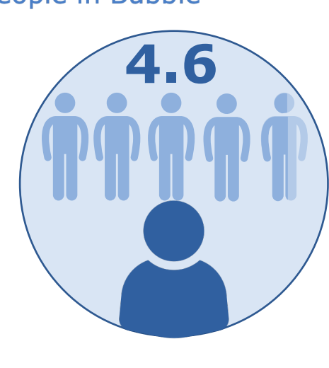
Size of Bubble in past two weeks