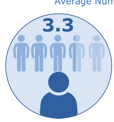
Size of Bubble in first month of 'lockdowns'