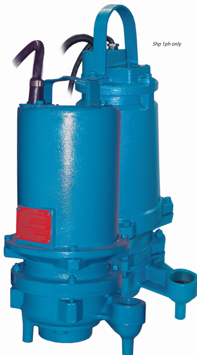
5hp 1ph only

SGV pumps provide broad design flexibility with a choice of basin configurations. The UltraCAP II™ dry well level control system options and a variety of control panels and accessories allow system customization. Exclusive non-fouling controls eliminate routine, maintenance service calls.