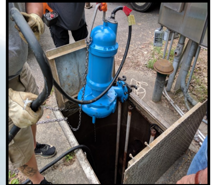
Barnes Sithe chopper pump at Pataskala, OH

Equipped with hardened and heat treated cutting blades, Sithe has been chopping and pumping away the solids since June 2017 with zero downtime.