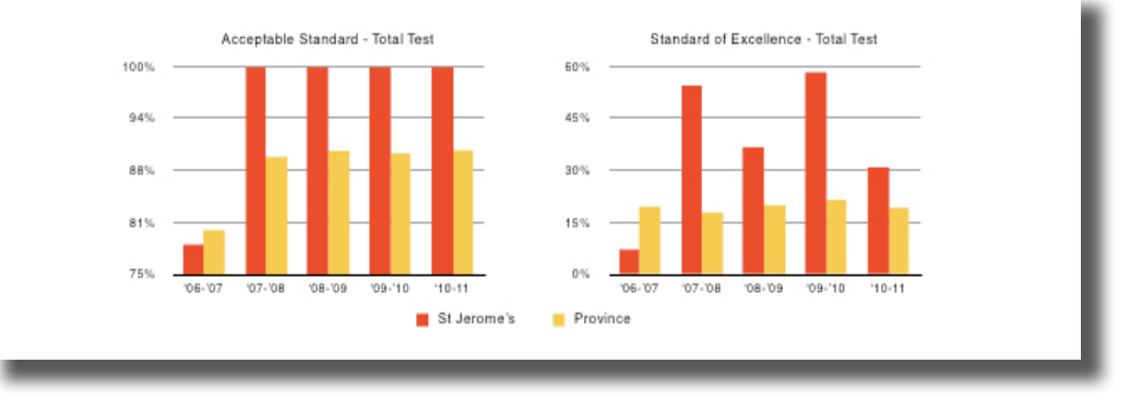
"We have been participating in Empowering Writers since 2007 and have seen our writing and reading scores soar. This wonderful program has certainly given our children the power to be great writers!"

In 2007, the elementary teachers of St Jerome's School in Vermilion, Alberta attended Empowering Writers instruction in an effort to improve their students' writing. The results were immediate. St. Jerome's teachers have maintained this high standard of writing for the past 4 years.