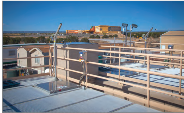
ClearLogic® MBR near Flagstaff, AZ.

The ClearLogic® membrane bioreactor (MBR) provides peace of mind to its owners through WesTech's 40+ years of designing reliable and practical wastewater treatment solutions. Customers choose WesTech for superior service and the ability to provide complete systems that can include all instrumentation and control systems, as well as headworks and tankage. Choosing an MBR integrator with the process knowledge and years of wastewater experience is a vital part of your MBR solution.