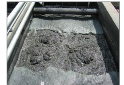
ClearLogic® MBR at Melville, NY.