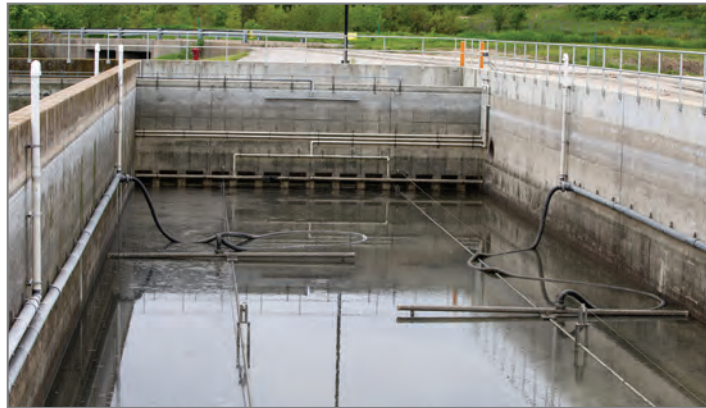
Sludge Sucker unit near Oswego, IL.

The Sludge Sucker™ sludge removal system collects sludge in surface water applications and effectively removes light sludges such as alum or ferric hydroxide or light iron and manganese precipitates in potable water supplies.