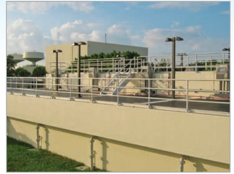
Basins with 4 Modules Each

This system provides simple operation while reducing energy and maintenance costs. Through the plant the system achieves on average 96% and 98% of TSS and CBOD 5 removal respectively.