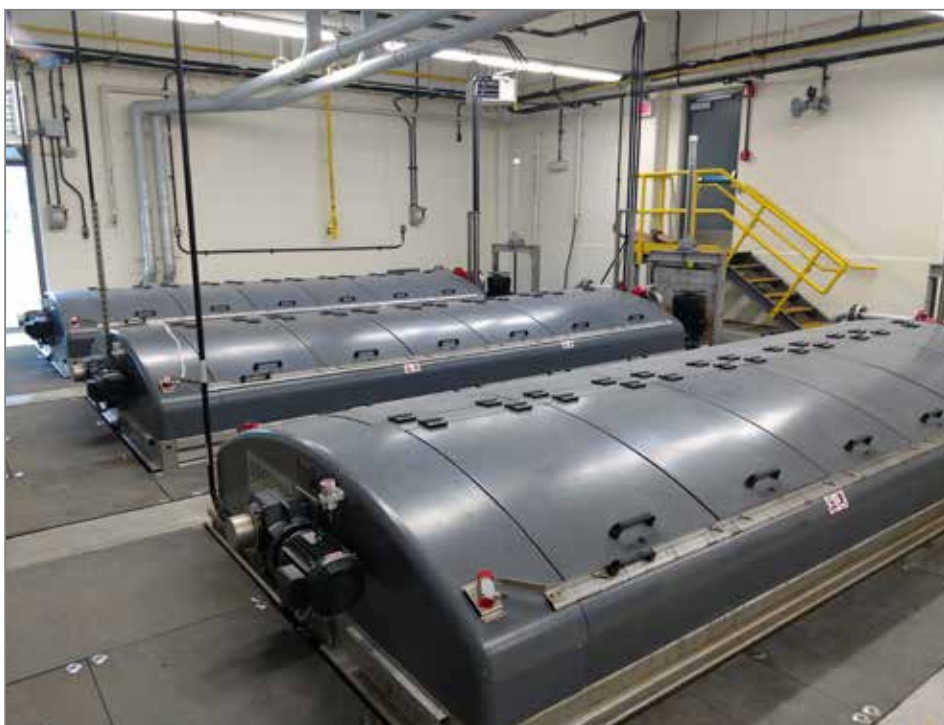
The plant's three-unit SuperDisc phosphorous removal system

The plant's SuperDisc phosphorous treatment system meets the plant's tertiary wastewater delivery needs, providing backup capacity and the ability to operate without downtime during routine maintenance. The effluent averages less than 0.1 mg/L of phosphorous per month.