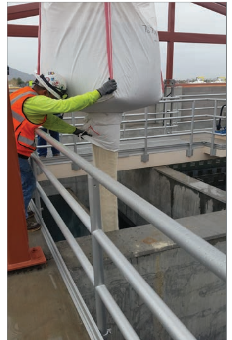
Added sand during process start-up

a small footprint. The RapiSand provides high performance clarification with a space savings of up to 90% when compared to the size of conventional treatment. At Santan Vista, ballasted flocculation is followed by ozonation, media filtration, and chlorine disinfection. This facility also has the ability to recycle filter backwash and clarified underflow using a WesTech SuperSettler™ lamella-type plate clarifier.