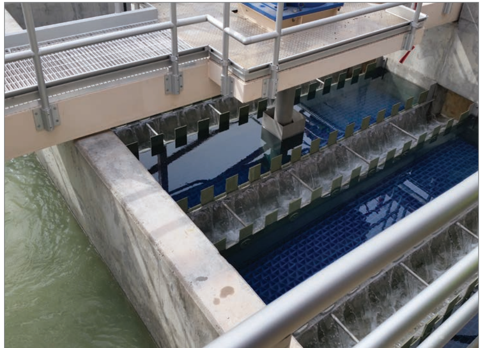
High-rate sedimentation process tank