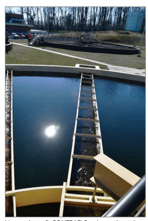
New and retrofit CONTRAFLO units on-site at the City of Lebanon Authority WTP

Through use of proper chemical addition, the plant is able to minimize solids loading on the filter. Furthermore, CONTRAFLO efficiencies have enabled the plant to cut back on its chemical consumption, resulting in an overall improved operation. The plant's filter backwash frequency is 72 hours, as regulated by the Pennsylvania DEP.