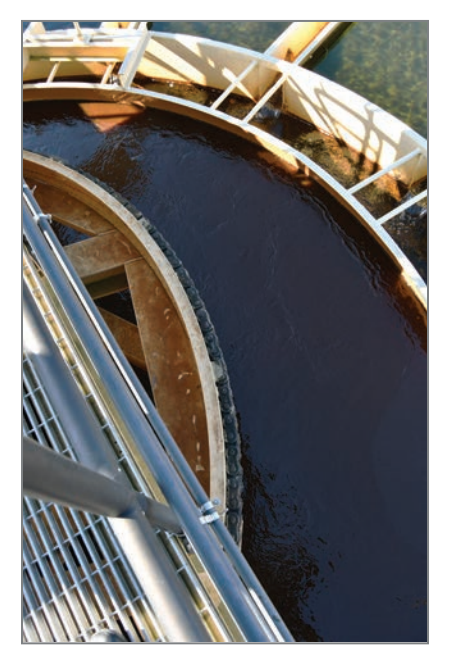
Newly painted CONTRAFLO unit installed in 2005

The draft tube that houses the marine propeller extends all the way to the basin floor, where settled sludge accumulates. The propeller generates an upflow inside the draft tube, which lifts previously settled sludge and mixes with influent flow to produce a higher solids concentration in the reaction zone, resulting in enhanced flocculation and a better solids contacting ratio. Operators have the ability to use sludge blanket operation, where a deeper sludge bed outside of the cone can act as a filter and catalyst, collecting small particles of sludge and forcing chemical reactions to completion. Operators can also adjust and fine-tune the mixer while the unit is operating. In addition, they can service the roller tooth gear and pinion scraper drive without removing the drive platform.