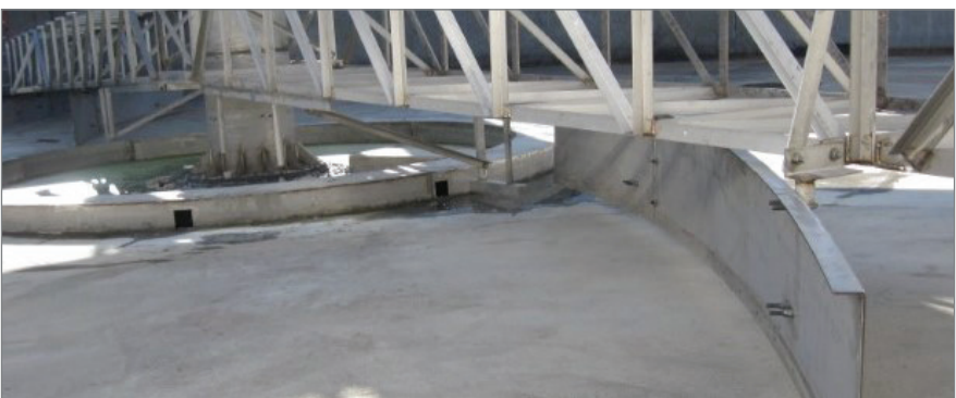
WesTech's Spiral Blade and Sludge Ring

In 2011, Medford upgraded its facility and again chose WesTech to replace the facility's clarifiers with COP<sup>™</sup> (Clarifier Optimization Package) Spiral Blade Clarifiers. Components such as a flocculating feedwell, spiral rake blades, a sludge withdrawal ring, and an energy dissipating inlet (EDI) make the COP one of WesTech's most efficient clarifiers. These components work together to optimize the clarification process from influent to effluent.