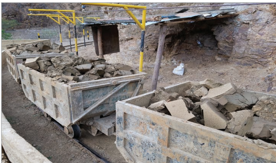
Cake Solids Bound for the Lined Fill Site