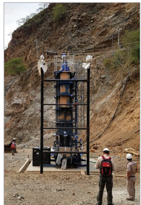
The CONTRAFAST Pilot Unit

it a good choice in locations where space is an issue. It can run at rise rates that exceed 14.76 cubic meters per hour per square meter (14.76 m 3 /hour/m 2 ), or 6 gallons per minute (gpm) per square foot. This is over 12 times the hydraulic loading rate typically used for conventional clarifiers.