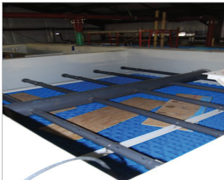
Stage 1: Tube Settling

The process begins with the addition of a cation coagulant and polyaluminum chloride, which are injected into the raw water ahead of the system's static mixer. An anionic flocculant aid polymer is added just ahead of the tank to assist in floc formation. The chemically treated water enters at the bottom of the unit and flows upward through the section and through the tube settlers, removing most