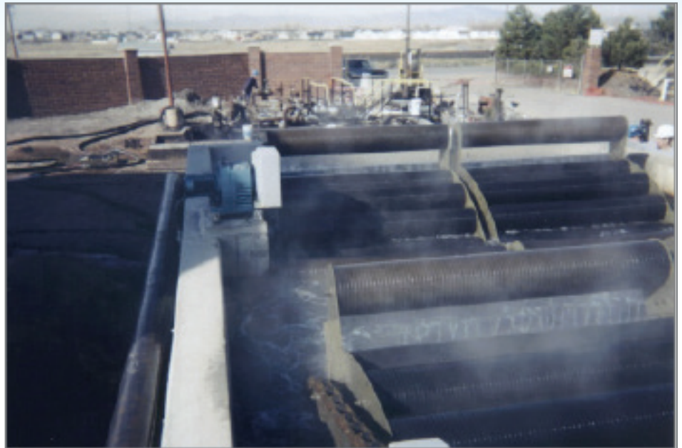
The STM-Aerotor® biological nutrient removal system uses integrated fixed film and activated sludge technology to provide biological nutrient removal for industrial wastewater treatment.

The effluent data shows that the STM-Aerotor successfully met the 5 ppm limit. The organisms in the pilot plant tank successfully oxidized the influent BTEX. Throughout this study, the influent BTEX varied considerably, but the effluent BTEX remained around 1 ppm. During a stress test, the pilot unit received flow rates well above its design. Even during these high flows, the pilot plant removed the BTEX below the 5 ppm limit.